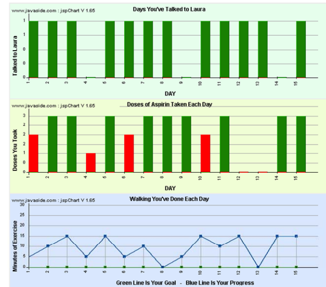
Figure 2. Self-Monitoring Charts

The system runs on a laptop computer as a stand-alone system, and is designed for a one-month daily contact intervention. A typical daily conversation lasts ten minutes and includes: (1) the agent walking on screen and greeting the patient; (2) conducting social and empathic chat; (3) assessing the patient's behavior since the last conversation; (4) providing feedback on this behavior (positive reinforcement or problem solving); (5) providing tips or relevant educational material (e.g., managing side effects, coping, etc.); (6) setting new behavioral goals for the patient to work towards before the next conversation; and (7) a